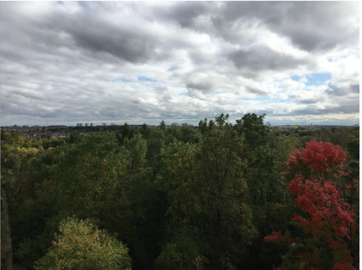
Treetops over Camp Naivelt, October 2019.