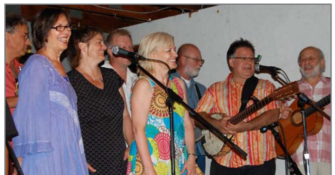
Concert Finale: "Goodnight Irene"