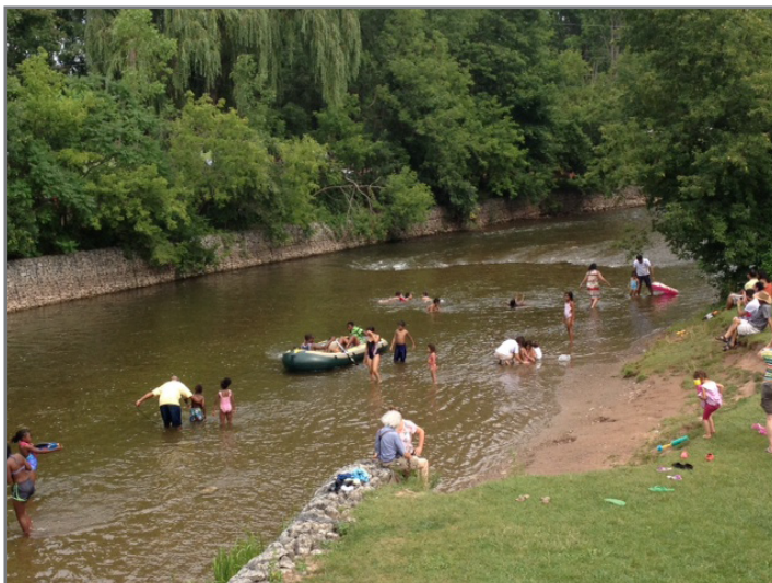
Oh, the Credit River... Refreshing!