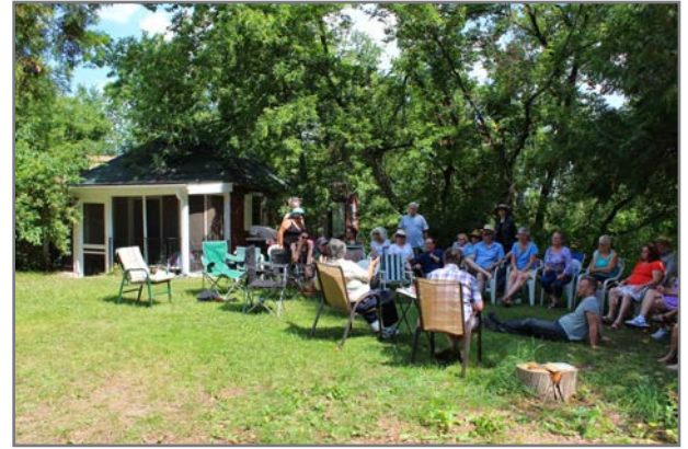
Bagel Brunches for mind and body.