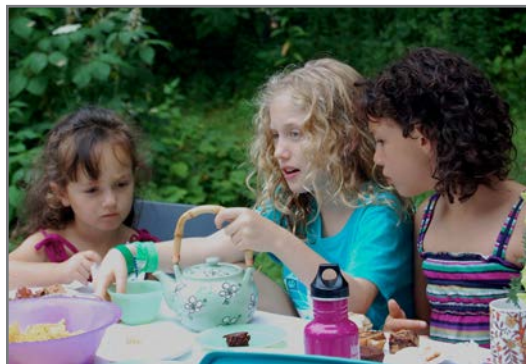
Never too young to form meaningful bonds.