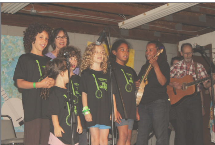
Singing and making a community.