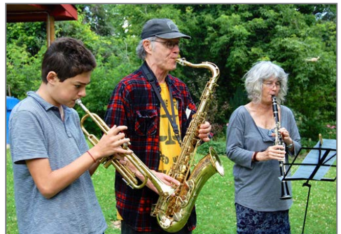
Klezmer music in July...